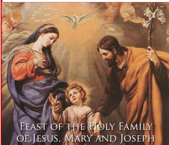
FEAST OF THE HOLY FAMILY OF JESUS, MARY AND JOSEPH

Today, as we celebrate the Feast of the Holy Family, the Scriptures invite us to reflect on the sacredness of family life and the virtues that sustain it. In the first reading, Sirach highlights the duty of honoring parents, a commandment that brings blessings of peace and long life. This respect reflects the divine order within families, where love and mutual care mirror God's relationship with us. Psalm 128 echoes this theme, blessing those who walk in God's ways with the joy of a flourishing family life. The Holy Family—Jesus, Mary, and Joseph—exemplifies this harmony. Their life was not free of hardship, yet their trust in God and love for one another gave them the strength to persevere, reminding us that holiness in family life comes from fidelity to God and selfless love for each other.