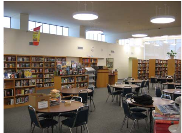
Santa Maria High School's Renovated Library