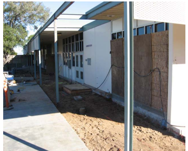
Righetti High Administration Offices Renovation