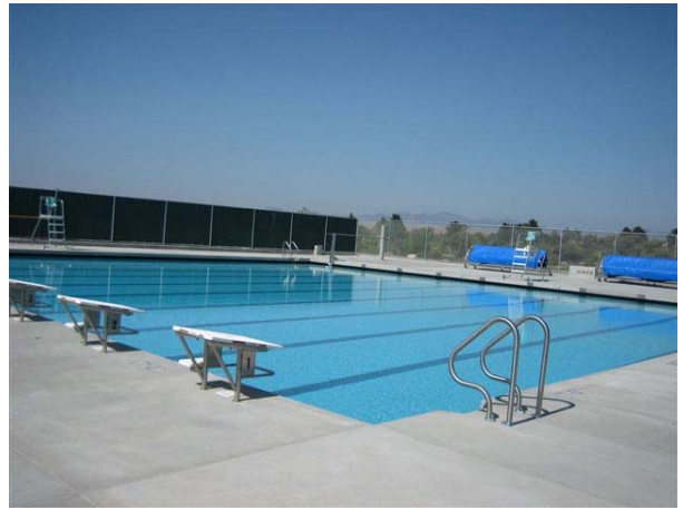
Righetti's New Physical Education Classrooms & Swimming Pool