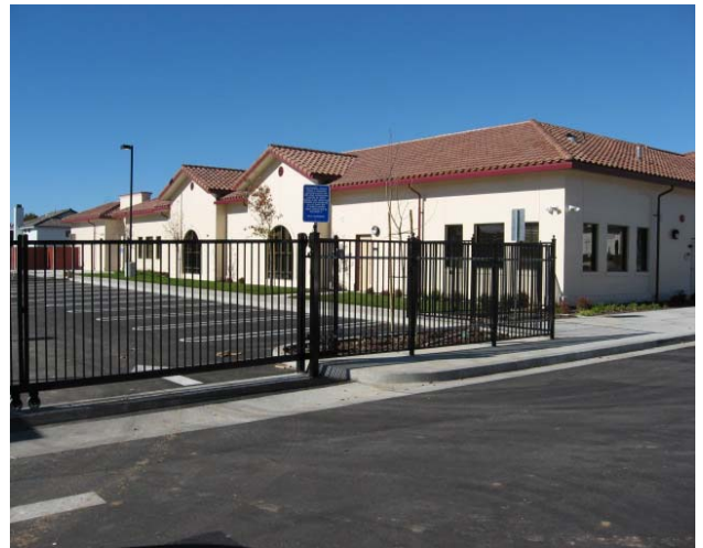
New Delta High Facilities