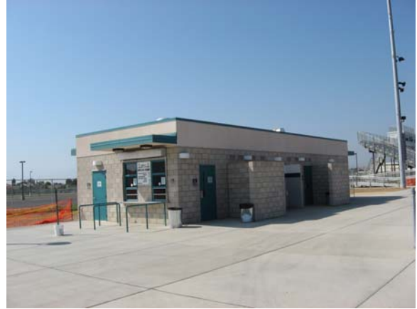
Pioneer Valley High School's New Stadium & Concession Stand