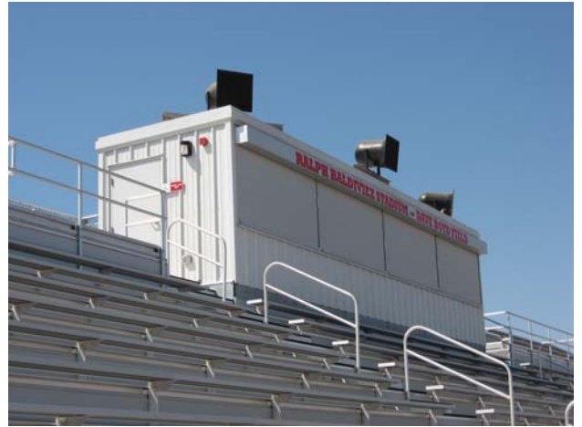
Santa Maria High's Stadium Replacement/Renovation