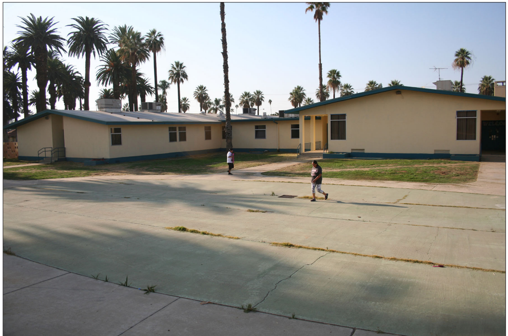
Figure 3. Outside view of the Winona Dormitory