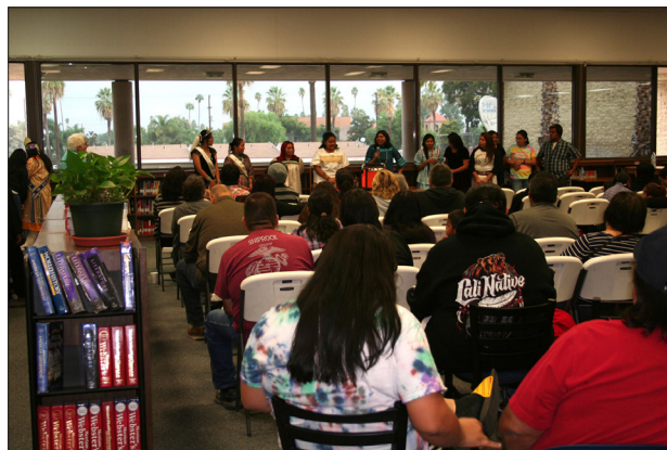
Figure 2. The White Rose Singers (front) performing for parents in our school library prior to the parent teacher conference.

It should be noted that there are several other Sherman-based student organizations that meet after school to enhance student learning, career interest, and enjoyment. These organization