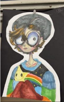
Oriya Busey, 9th