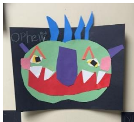
Ophelia Kimokeo, Kindergarten