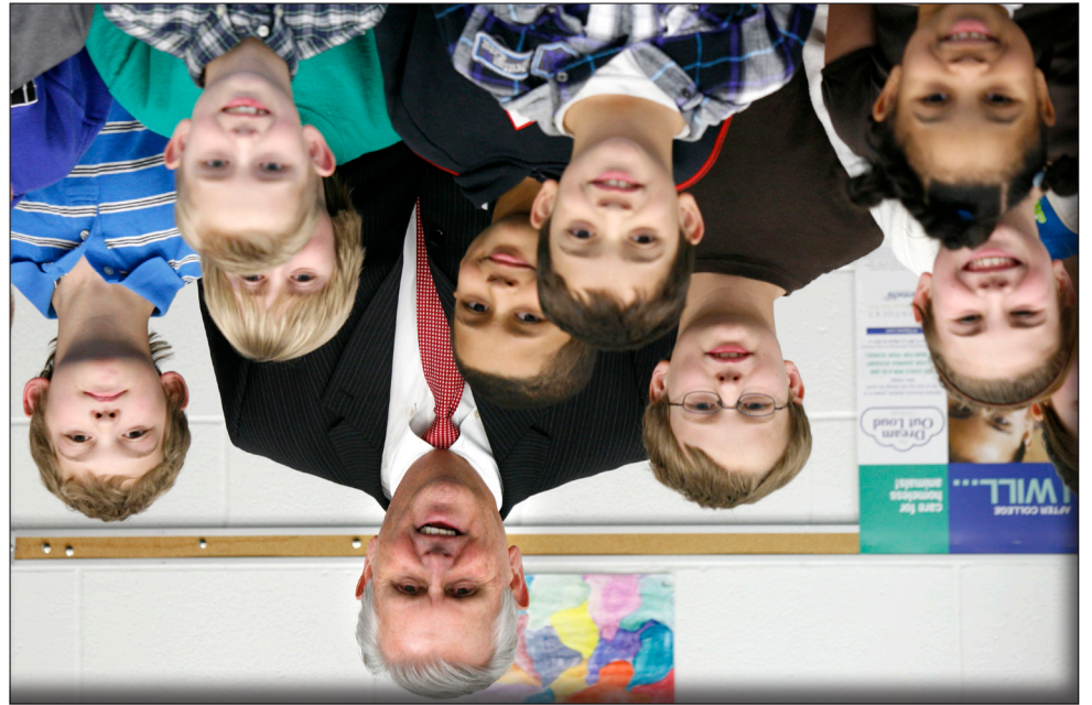
Terry Holliday, Ph.D. Kentucky Education Commissioner

In 2009, Kentucky legislators passed Senate Bill 1, which required many changes in the state's public education system. It included a call for new, more rigorous academic standards and new state tests based on those standards. Senate Bill 1 also called for a more balanced assessment and accountability system focused on student readiness for life after high school. Two years later, Kentucky became the first state in the nation to adopt the Common Core State Standards in English/language arts and mathematics. These new standards, known as the Kentucky Core Academic Standards, are designed to be more rigorous and aligned with college coursework and the 21st-century skills required in the workplace. They were first taught in the 2011-12 school year, with students tested on them at the end of the school year. This brochure outlines Kentucky's state assessments, when they are given, other tests your child may take and how the results will be used. Many of these tests will form the basis for the new Unbridled Learning: College/Career-Readiness for All accountability system. Our goal is every child proficient and prepared for success, which means college/career-ready when they graduate from high school. I hope you will take the time to review the information here and join us in helping your child succeed and become college/career-ready.