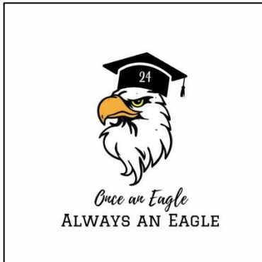
FRONT LEFT POCKET AREA

The T-shirt will be black, short-sleeved, and made by Gildan. Art and lettering will be white with bright green accents.