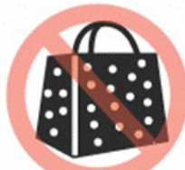
Printed patterned plastic bag