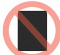
Colored plastic storage bag