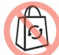
Reusable grocery tote