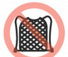
Mesh or straw bag