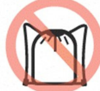
Solid color cinch bag