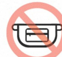
Large fanny pack