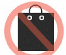
Large tote bag