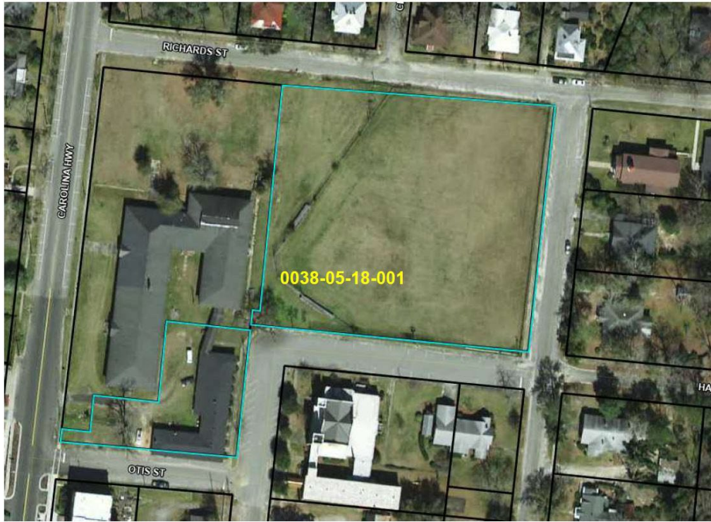
Bamberg County GIS