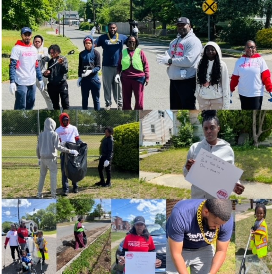
Some of our Steering Committee members and youth leaders participated in the Paulsboro Annual Spring Clean-up Event in April 2024.