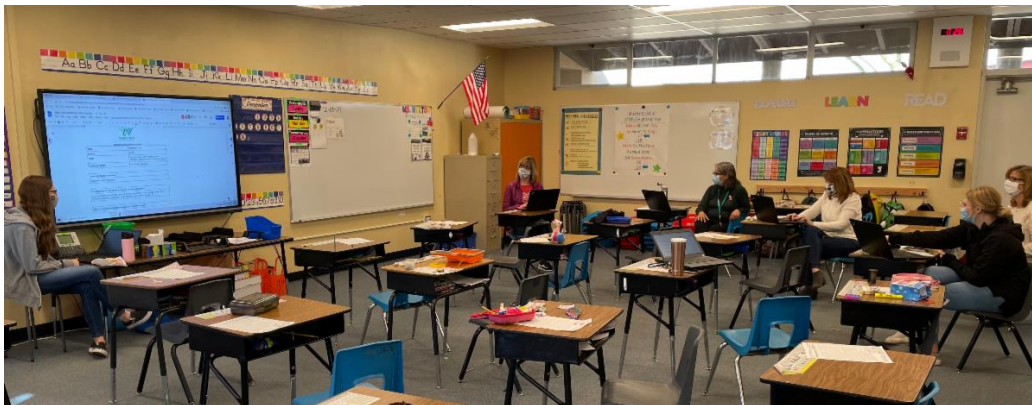
ACES Professional Learning Community Team Collaboration