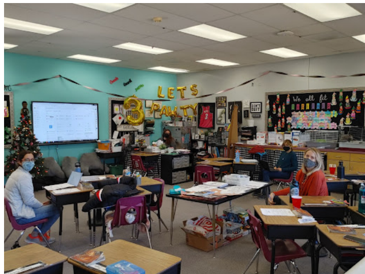
Image - TVES Professional Learning Community Team Collaboration.

We would like to thank our teachers, administrators, and staff members for all the great work they have done this school year to ensure students are learning at high levels. Despite the pandemic period which has challenged students, staff and families, their collaboration and dedication have enabled student progress and increased achievement levels at all grade levels.