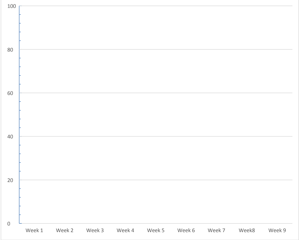
Progress Monitoring Graph (sample graph to be used after interventions using PM to plot progress)