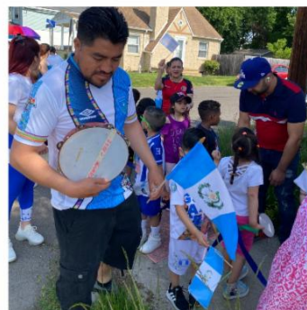
Students at Hamilton 1 and Pleasantville Head Start centers celebrated Culture Day, where they learned about one another's cultures by dressing up, making crafts, listening to music, and enjoying other fun activities to spread cultural awareness.