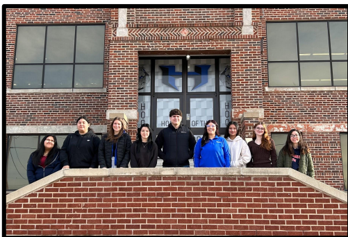
The Hooker Happenings Staff