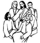
Calling the Twelve to him, he sent them out two by two. Mark 6:7 (NIV)

O J B B L Q D T U N I C Y H A S X H A O R R Y R C M B R L H T K L G B X O J G E Q L P C T A M B J O U R N E Y P R O Q M F V P R E A C H A J X E P R Q F I R P E C H H N E E N N L P M L K P V A W F O D U S J T M G L W W C K D S Q D S A U J A C A Y T T E A C H I N G O S W T G P A O E V I L S M O N E Y W E R K O T S P I R I T S Y S E L J E A U T H O R I T Y R T L H P J Q H E A L E D T K N P V F S A N D A L S O T M E W V E Q F Y N O T H I N G S Z Z X