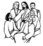
Calling the Twelve to him, he sent them out two by two. Mark 6:7 (NIV)