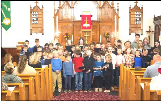
ALIS students sang at the Reformation Rally held at Bethlehem Lutheran Church on Oct. 29.

Bethlehem Lutheran Ch.–Sun. 9:30am; SS 10:45am Immanuel Lutheran Ch.–Sat. 6 pm, Sun. 8:30/11am SS 9:55am St. Paul’s (Blue Point) Lutheran Ch.–Sun.9:30am; SS 8:30am Zion Lutheran Ch.–Sun.8am; SS 9:15am