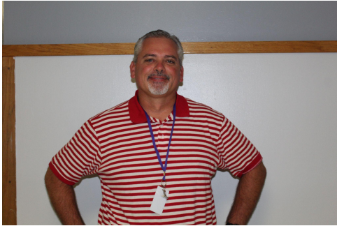
Article By: Alyssa Parker