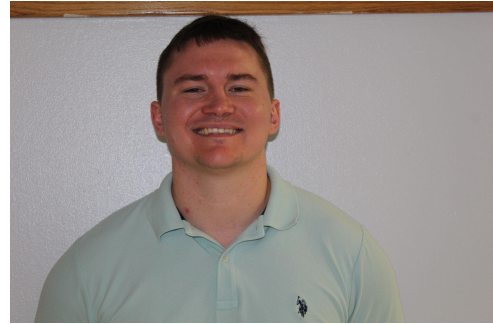
Article by: Gia East and Nevaeh Post