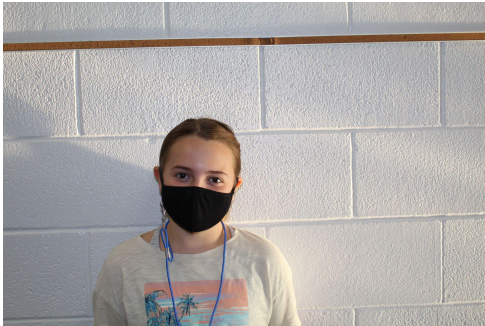
Article by Paris Burdex