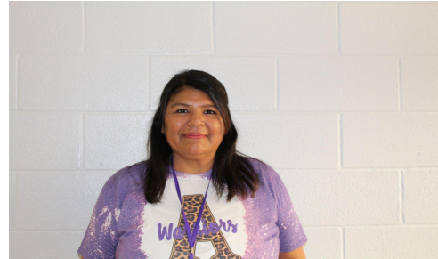
Article By: Tia Tillis