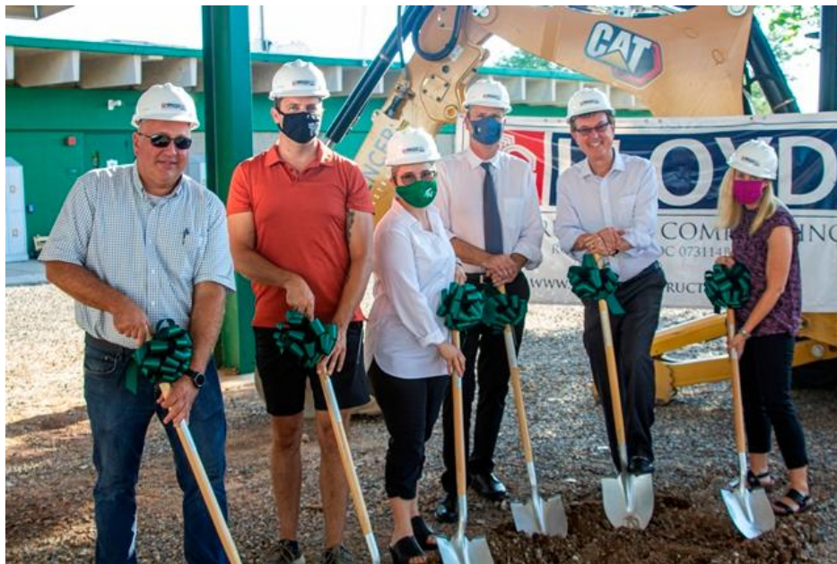
Governing Board and Superintendent at the September Groundbreaking Celebration

Please see Photo Gallery below for images from new construction projects.