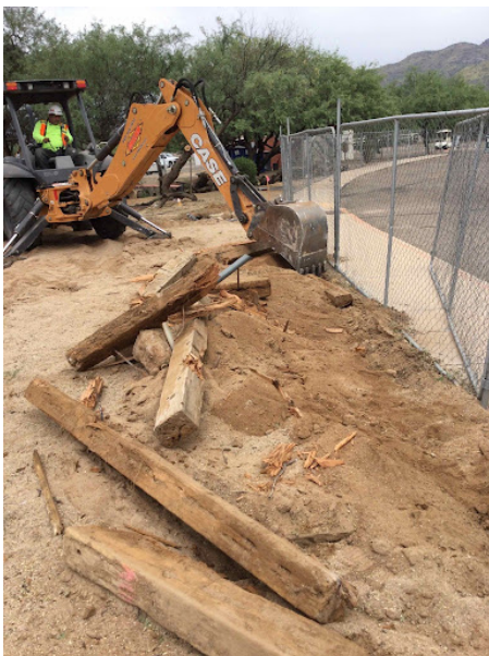
Agua Caliente Elementary School