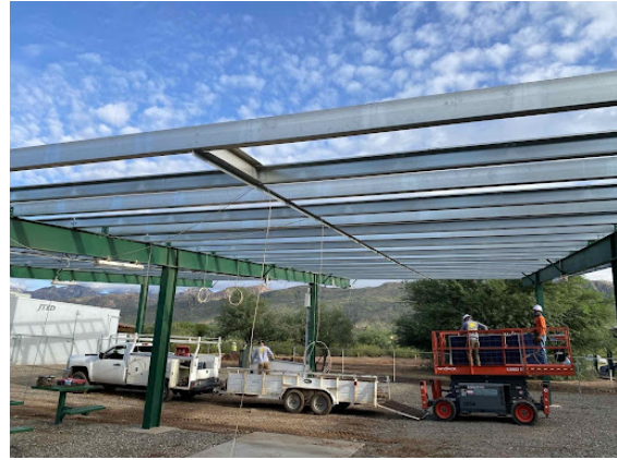
TVHS Solar Panel Removal for Repositioning