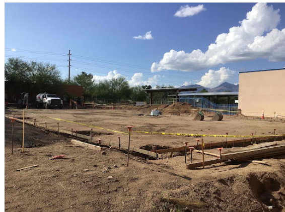
Emily Gray Jr. High Site Prep for New Fine and Performing Arts Building