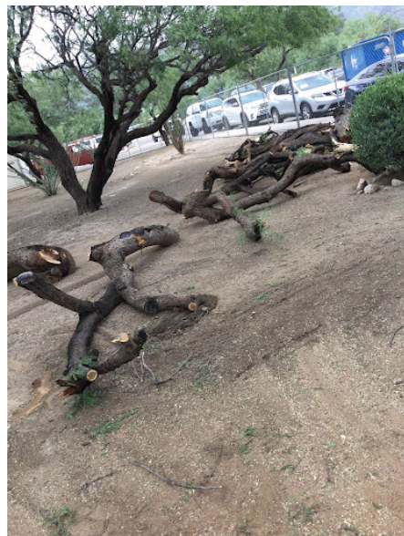
Agua Caliente Elementary School - Trees Salvaged from Site of New Building for use in Nature Trail