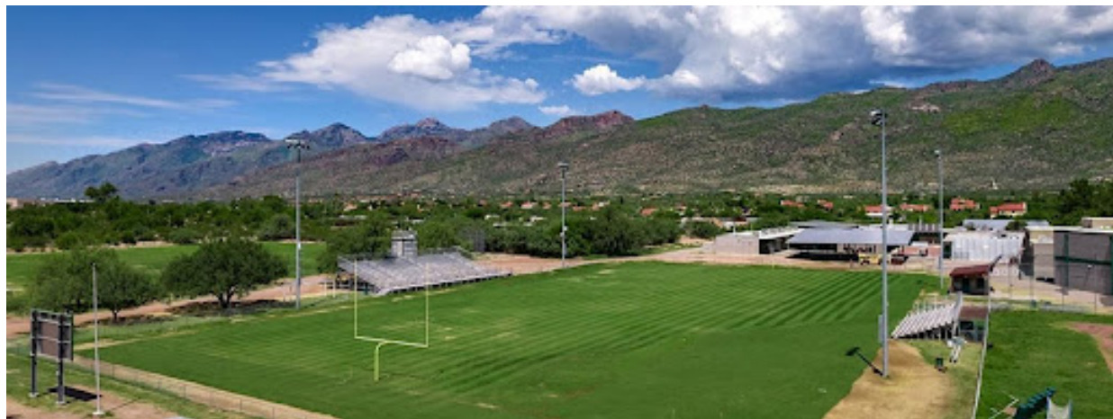
New Tanque Verde High School Stadium Field