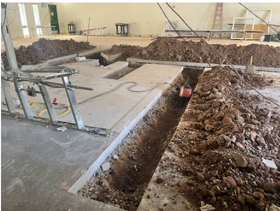
TVHS Library/New Administration Building Interior Modifications