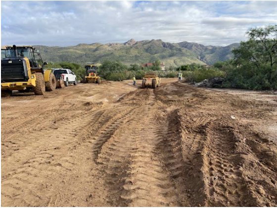
TVHS Site Prep