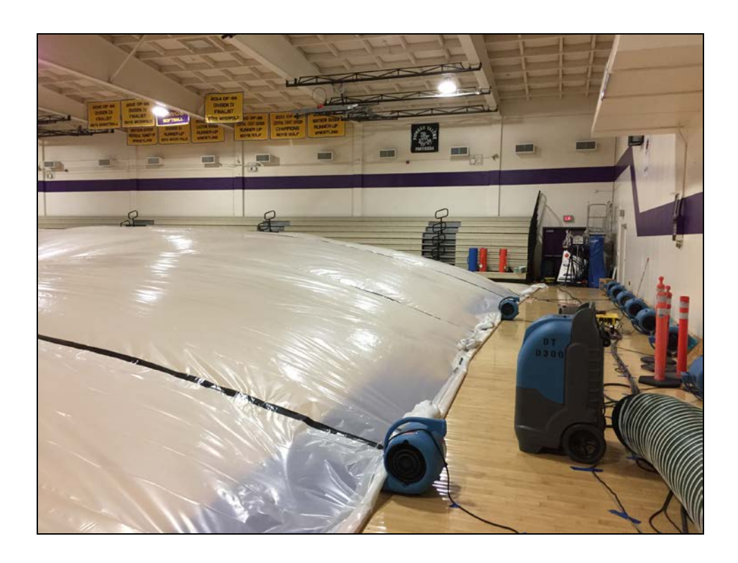
ERHS - Gymnasium Water Restoration in Full Swing