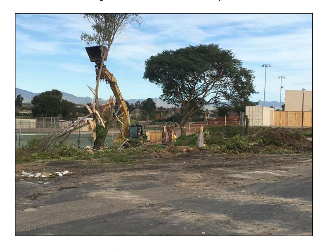
ERHS 38 Classroom Building - Construction Begins over Winter Break