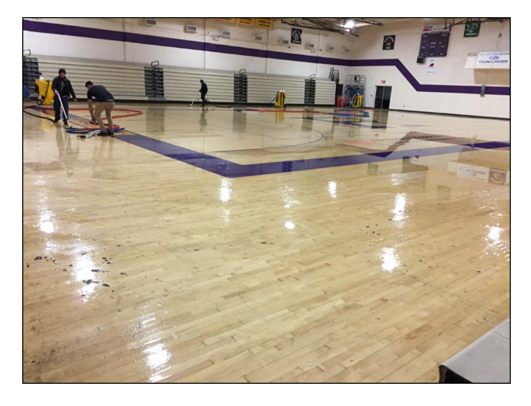
ERHS - Gymnasium Fire Sprinkler Water Leak; M&O Team Begins the Clean-up