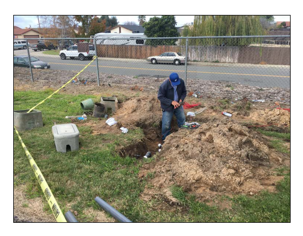
ERHS - Juan Rodriguez Modifies Irrigation Controls for Track & Field Storage Units