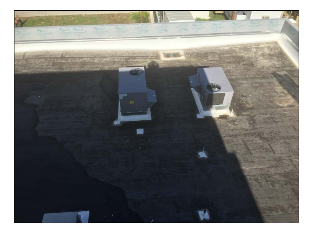
PVHS Performing Arts Center - Built-up Roof and HVAC Installation In-progress