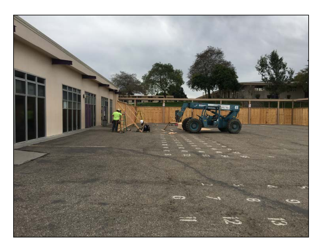
ERHS 38 Classroom Building - Barriers Installed to Separate Construction & School