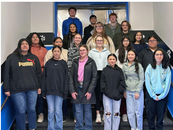
The Hooker Happenings Staff