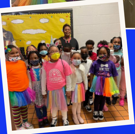
Charles F. Hard Elementary School