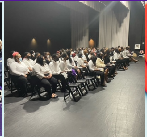
Meet the newest inductees to the National Beta Club & Honor Society! We salute you!