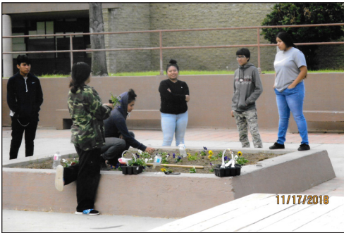
Figure 1. Choice dorm students participating in the campus beautification program.