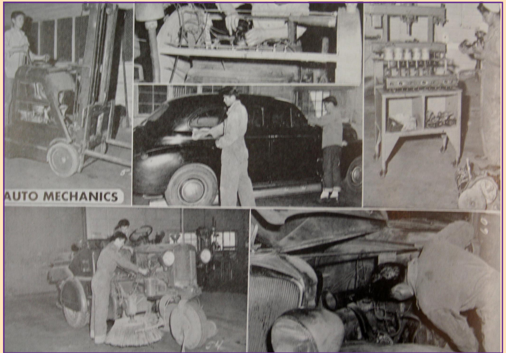
Figure 14. Photographs of Sherman's 1948 Auto Mechanics classes.

The Sherman Pathways Construction course introduces students to general woodworking practices. Teacher Brian Hayden's students learn safety and the use of hand tools, power tools, and woodworking machinery. Initially students work on various basic wood projects. As students become more skilled they have the opportunity to work independently to design and construct more advanced projects as chairs and tables. This course provides students with the skills needed in the construction industry. Click here for a firsthand video look at this class.