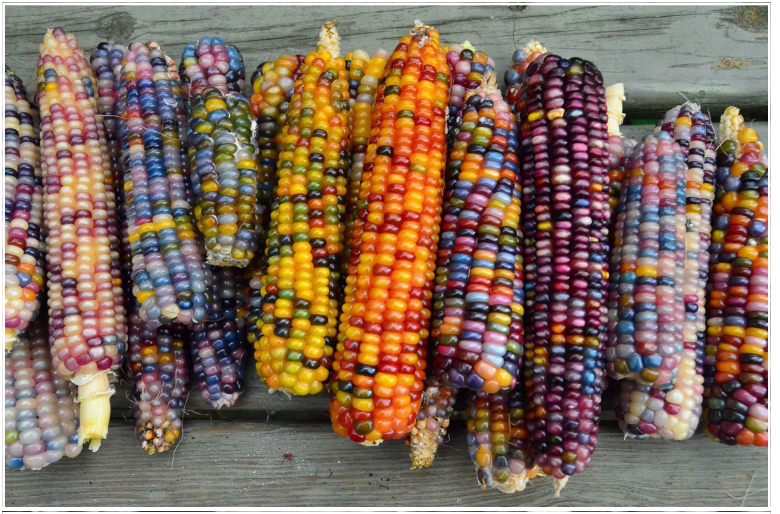
Figure 11. Traditional Native foods. Upper left: Salmon. Upper Right: Corn Lower Right: Cornucopia of natural foods.