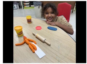
Creative Playdough time