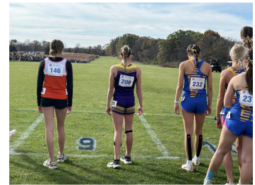
Just the beginning of the 5K!