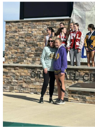
Getting that state medal!