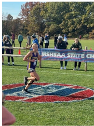
Coming in for the finish!!