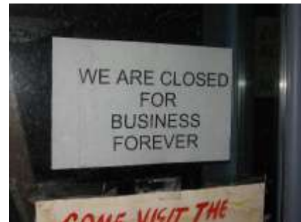
Loss of Job