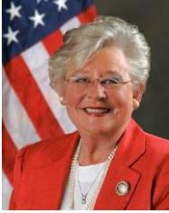
Kay Ivey, Governor President