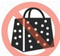
Printed patterned plastic bag