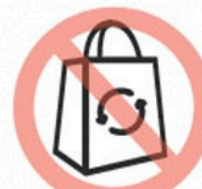
Reusable grocery tote