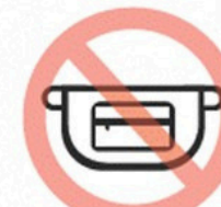
Large fanny pack