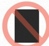
Colored plastic storage bag