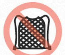
Mesh or straw bag