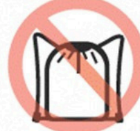
Solid color cinch bag