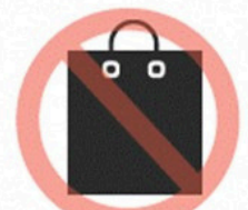
Large tote bag