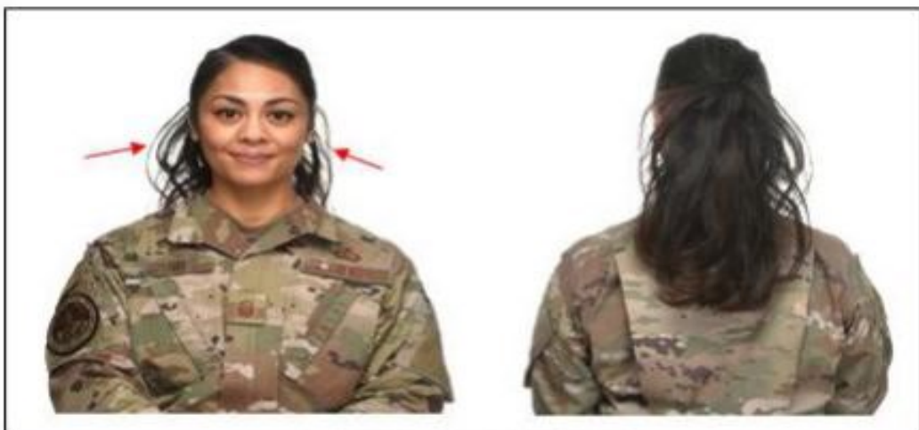
Bulk Exceeds Width of Head