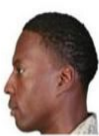
Figure 3.1. Male Hair Standards Examples.