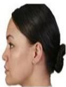
Figure 3.2. Female Hair Standards Examples.