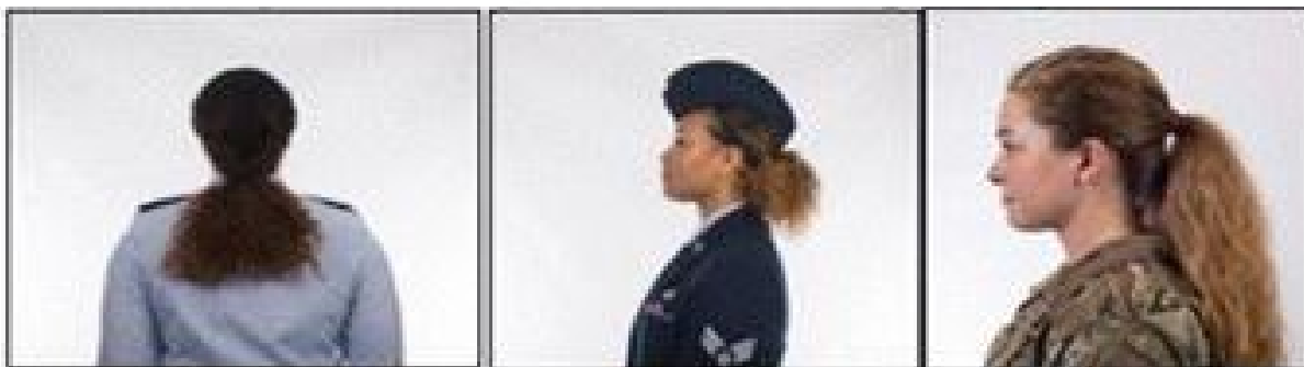
Pulled back secured and does not exceed 6 inch radius