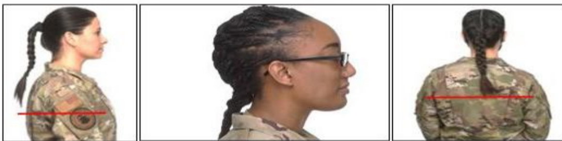
Braided Ponytails/Multiple Braids in a Single Ponytail