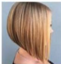
Figure 3.2. Female – Unauthorized Hair Examples.