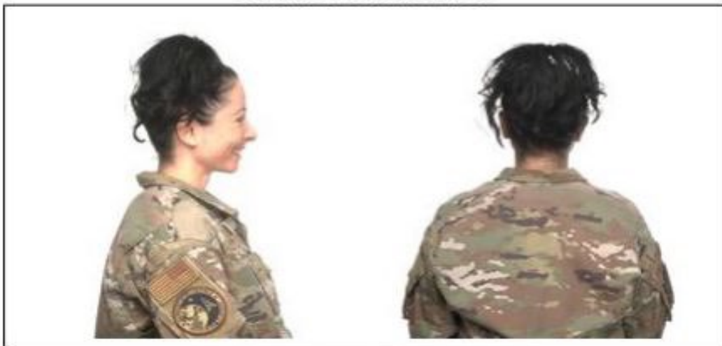
Ponytail Fasten on the Crown of Head