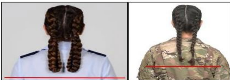
Two Braids Looped Underneath/Two Braids