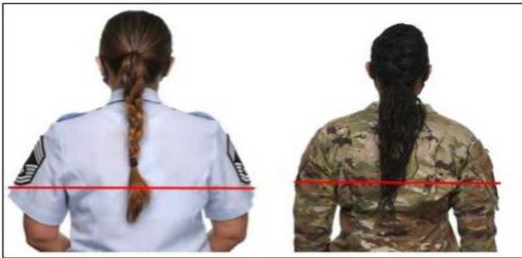
Exceeds Length Requirement