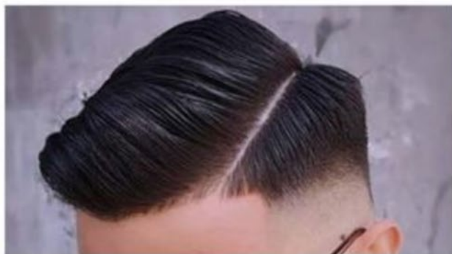
Figure 3.5. Cut, Clipped, or Shaved Part.