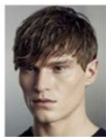
Figure 3.1. Male – Unauthorized Hair Examples.