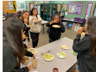
Picture: Students were enjoying a health snack (Apple Nachos) after researching Vegan nutritional plans