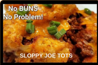
SLOPPY JOE TOTS