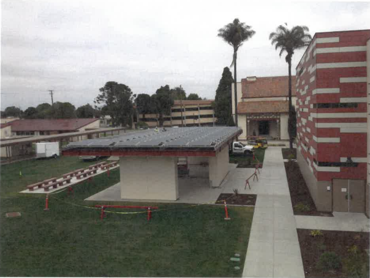
Santa Maria High School: New 14 Classroom Building