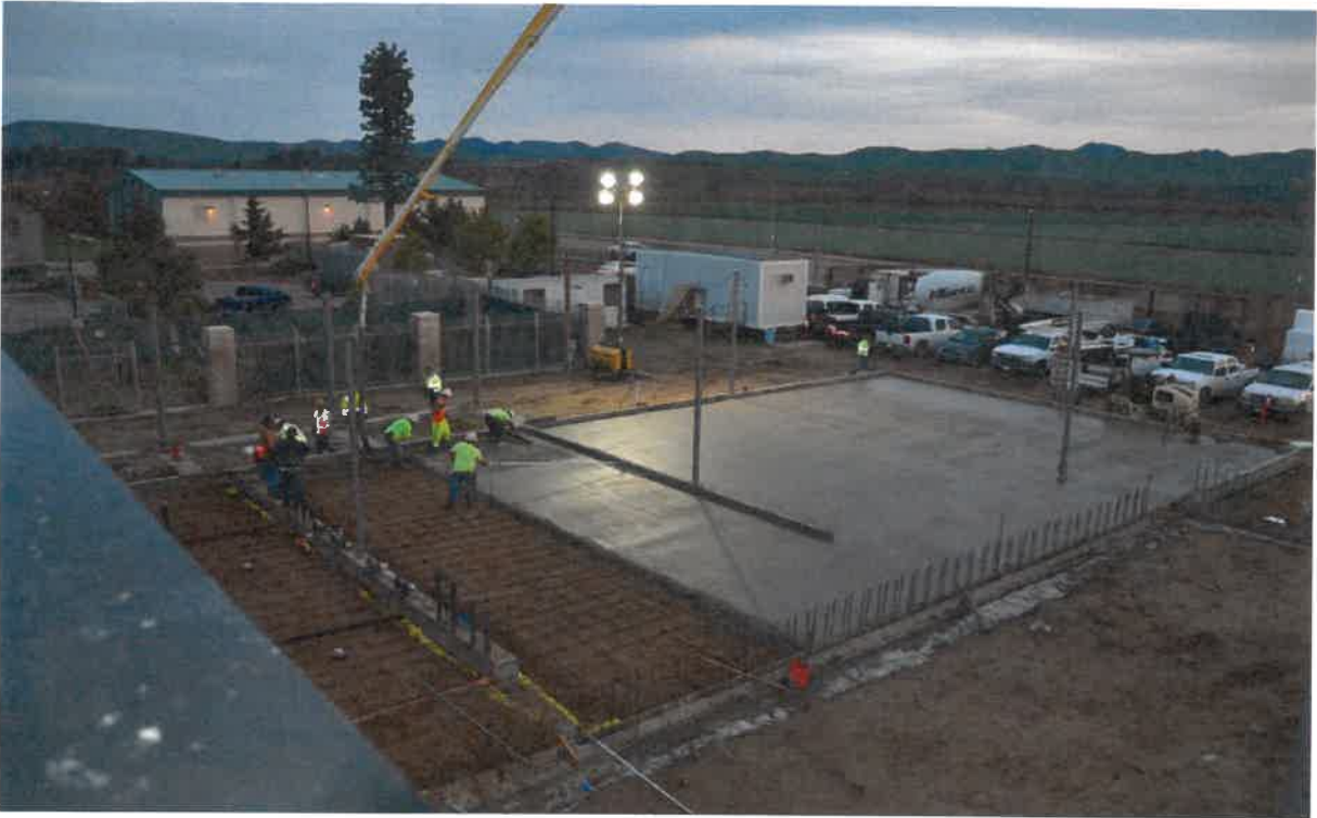
Pioneer Valley High School: Performing Arts Center