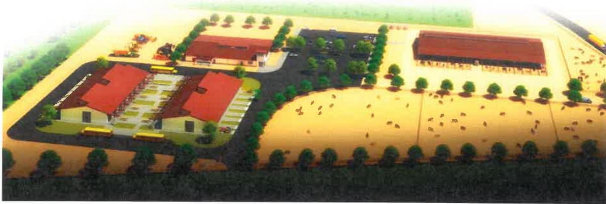
CTE/Ag Facility: Site Layout and Property Photo