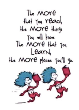
Have a great summer!