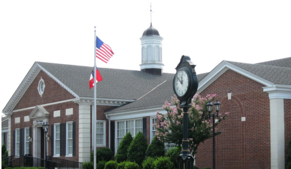
Eric P. Staples Building, Central Office, Perry, Georgia

The Houston County Board of Education typically meets twice a month. The formal session is held the second Tuesday of the month at 1:00 p.m. at the central office located at 1100 Main Street in Perry. The work session is held the Monday evening prior to the second Tuesday unless that Monday falls on a holiday. Work sessions are held at 6:00 p.m. at various schools or the central office. In addition, special meetings are called as needed. Community meetings are held occasionally to keep residents informed about issues and to give citizens the opportunity to comment on Board initiatives. Meetings are announced in advance through the local media and on the school district's website, hcbe.net . In addition, meetings are broadcast live online and videos are posted afterward.