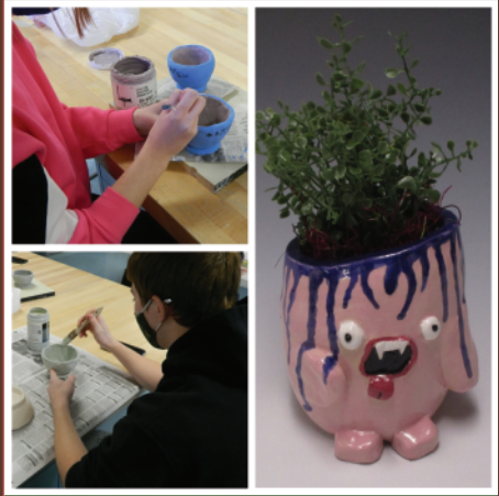
WORK WITH YOUR HANDS AND THE WHEEL IN CERAMICS.