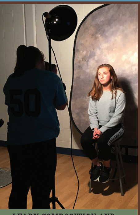
LEARN COMPOSITION AND LIGHTING IN PHOTOGRAPHY