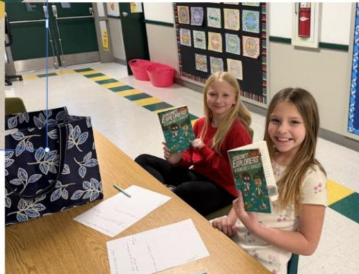
and even to the playground!