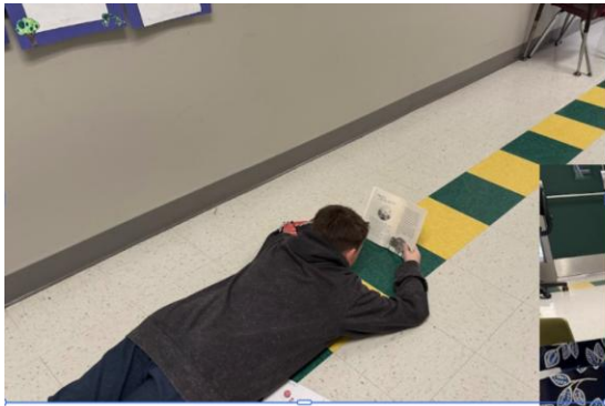
Sneaking away from their desks....