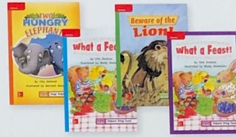
Two Hungry Elephants (Approaching), What a Feast! (On Level, ELL), Beware of the Lion! (Beyond)