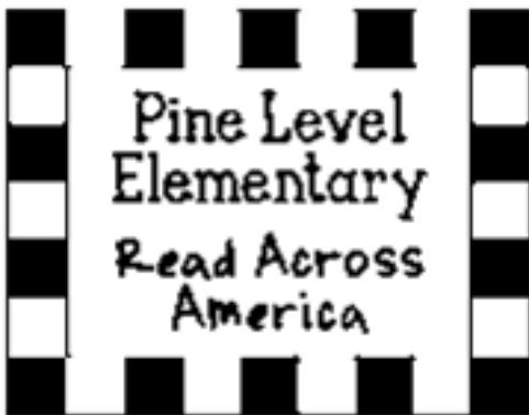
Front Design (where a pocket would be)