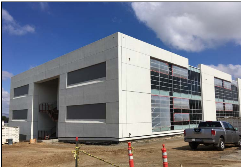
ERHS 38-Classroom Building – Exterior Painting is Underway and Nearing Completion