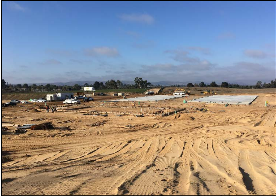
CTE Ag Center – Framing for the Culinary Arts Center in the Foreground with the Shop Classroom Concrete Slabs Behind