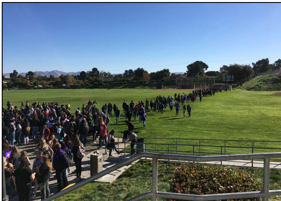
ERHS – The Whole Student Body Participates in the Great California Shakeout Earthquake Exercise