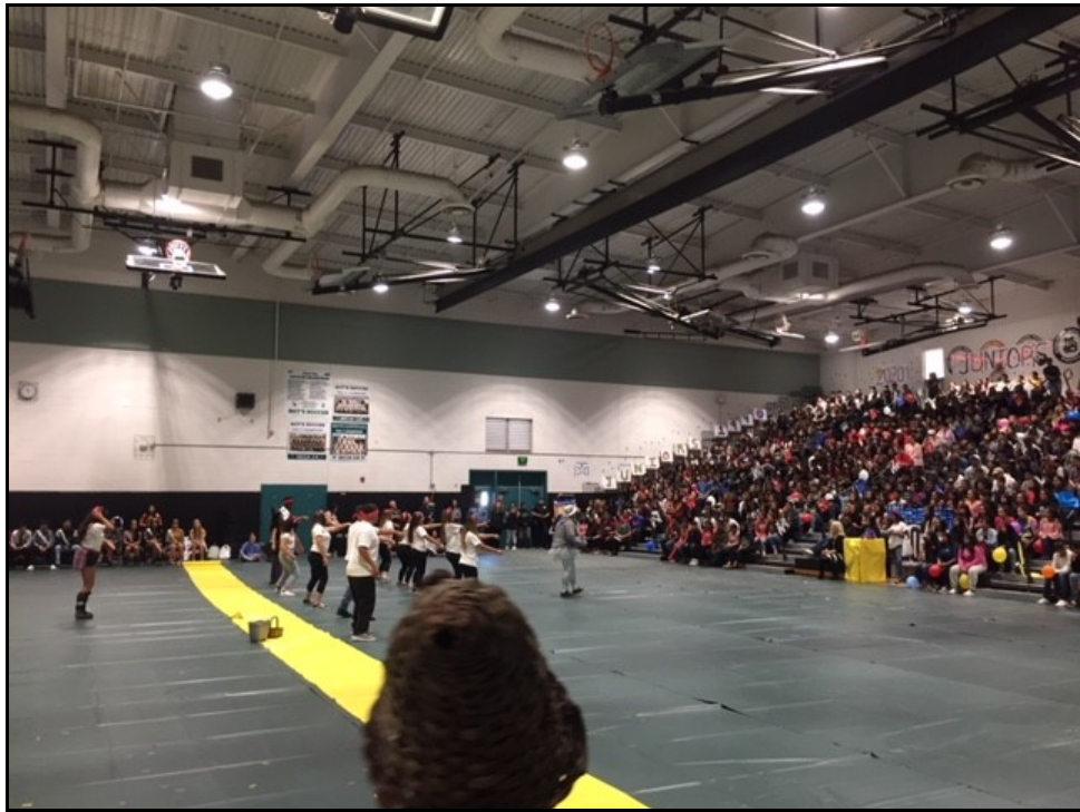
PVHS - All School Rally Adds School Spirit