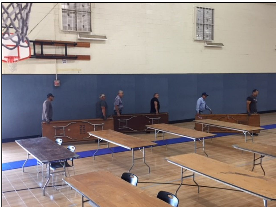
PVHS - M & O Crew Sets up the Edwards Center for PSAT Testing