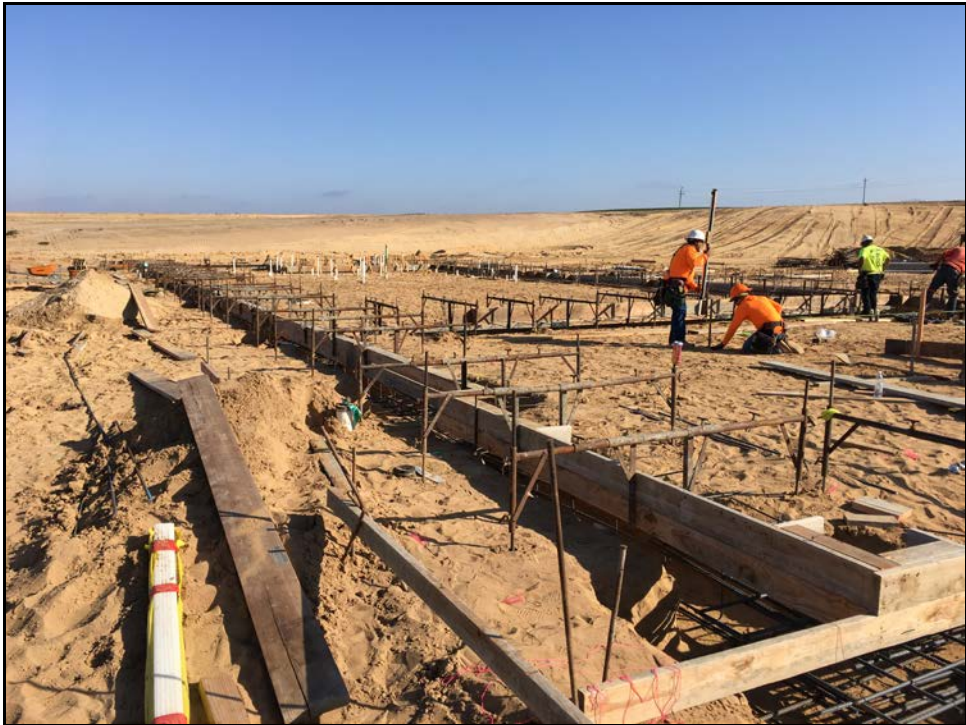
CTE Ag Center – Culinary Arts Foundation Framing and Utilities Installation in Progress