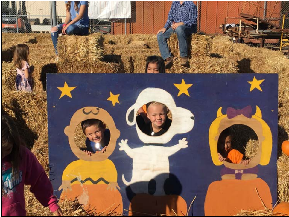
ERHS – Kinderpatch Photo Booth Stars