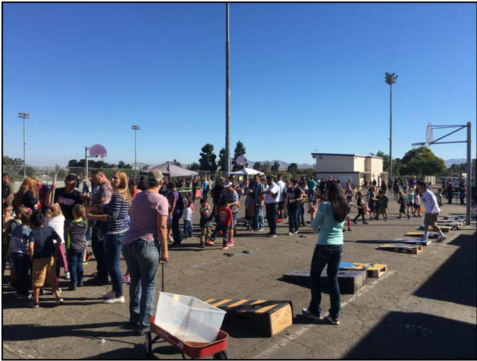
ERHS – FFA Kinderpatch was a Rousing Success!