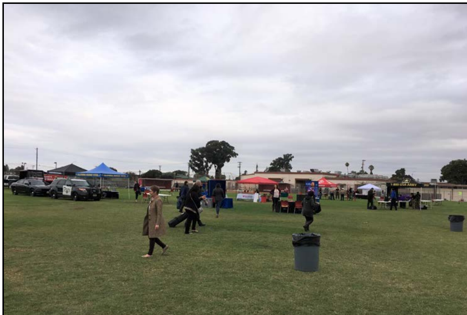
SMHS – Career Fair Setup by the Custodian Crew